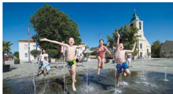
The Town Hall Square offers quite a lot during the hot summer season.

Rathausplatz was created at the end of the 1970s following the removal of a row of houses facing the town hall and the