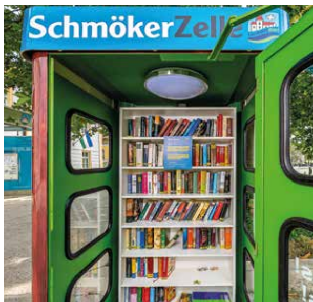
"Schmöker-Zelle" is a bookworm's dream – grab a book there!

The town's free library box right outside the town hall is well frequented. Every day, up to 20 book lovers pay a visit to the converted telephone booth to find fascinating, free literature. Anybody can take one or more books home and return them after reading – and add their own books as well. And if you are looking for something more specific, a good place to start is the public library on Marktplatz, where bookworms and avid readers have a choice of more than 6,000 works.