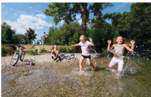
A popular place for relaxation: the Triesting river.

Leobersdorf is situated at the edge of the lush Triestingtal valley, and the picturesque River Triesting runs through the town. Around 60 kilometres long, the Triesting's source is in the Kaumberg region and it flows into the Danube by Schwechat. Flowing through Leobersdorf for 2.4 kilometres, the river provides a habitat for a variety of wildlife. In the future, we aim to prevent devastating floods such as those in 2002 and 1998, which is why the council, as a member of the Triesting Water Board, is working intensively on flood protection measures in the town.