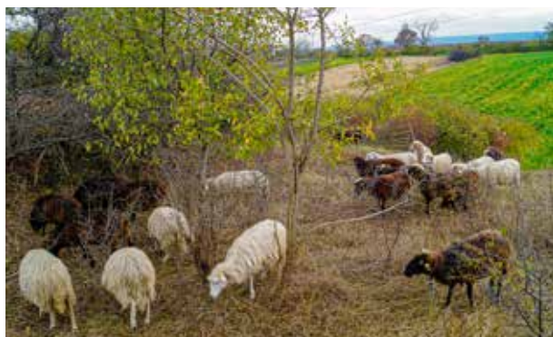
Sheep help protect precious dry grasslands at the Lindenberg.

As part of the Gesunde Gemeinde initiative, the town hosts around 20 health-related and nature events every year, such as cooking with wild herbs or workshops on natural cosmetics. The typical programme also includes nutritional advice and a chance to share experiences.