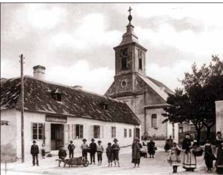
The square in front of the church in former times ...

targeted transformation of the centre into a shared space in 2008 reduced through traffic in the town centre while at the same time enhancing its attractiveness for shops. The project has demonstrably succeeded in reducing through traffic by almost 75%, and the average vehicle speed has been cut by lowering the speed limit to 20 km/h, coupled with construction measures and improved road design. The decrease in private traffic and the added opportunities of running short errands on foot or by bicycle have increased quality of life in the town and significantly reduced emissions. In 2011, the project received the Walk Space Award.