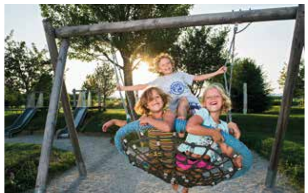
Leobersdorf's "Generations Park" – a paradise for young and old!

bewegungs.reich Leobersdorf comprises nine precisely measured routes in and around Leobersdorf with kilometre marks and signage for walkers, runners, Nordic walkers and hikers. Each individual route follows a loop from Rathausplatz and back again.