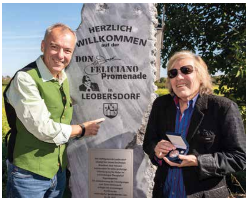
José Feliciano took part in the opening ceremony for his walkway.