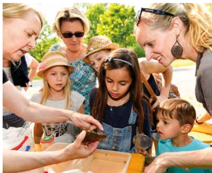
The annual family day provides a lot of nature experiences at the Generations Park.

Leobersdorf primary school has applied for the Umweltzeichen eco-label for education and schools. The Austrian eco-label certifies schools and teacher training colleges that make a strong commitment to protecting the environment, and to sustainable, socially-aware school development. Organic, regional food and health promotion are other important core issues for Umweltzeichen-certified schools.