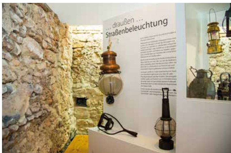
The Museum of Light LEUM is unique in Austria.

ubiquitous modern-day LEDs. The interactive museum features many eye-catching exhibits on Leobersdorf's diverse history and brings to life the work of a cooper – an important profession in a winemaking town.