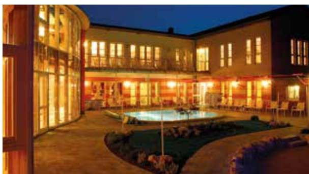
The "WellnessOase" is THE place to relax.

That's what the Leobersdorf WellnessOase spa has to offer. Classic sauna facilities and innovative wellness areas at all temperature levels guarantee a relaxing stay for body, mind and soul. Light therapy, soft music, aroma grottos and exclusive herbal infusions give a new lease of life while providing the ultimate relaxing experience. Cold mist showers, splish-splash systems, an outdoor pool and spacious shower areas offer a variety of options to cool off.