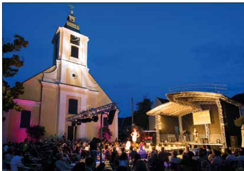
...Nowadays, it is the ideal place for events.