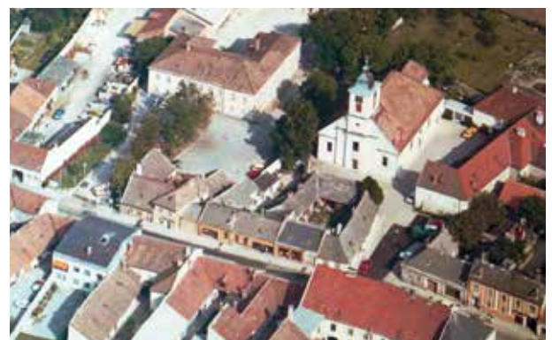
The spacious Town Hall Square in the city centre did not always exist.

Retail Structure Survey commissioned by the Chamber of Commerce and the province of Lower Austria. The study highlighted the overall design concept for Hauptstrasse and Rathausplatz, citing Leobersdorf as a textbook example of an outstanding town centre design which enhances quality for visitors. The town centre was awarded an overall grade of 1.4 for its modern design and landscaping. And there is plenty of parking in the town centre, with more than 300 spaces, while the town's signage system is a model for visitor orientation.