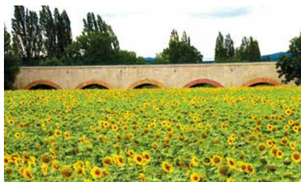
Vienna is supplied from the 1st Vienna Water Pipeline.

The 90-kilometre first Vienna mountain spring water transmission line, running from Kaiserbrunn an der Rax to the Austrian capital, crosses the Leobersdorf municipal area for about five kilometres. Two aqueducts with around 22 brick arches dominate the landscape in the town. Today it delivers 62 million cubic metres of water per year to the city, accounting for 44% of Vienna's drinking water supply.