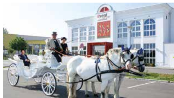
Wedding dreams come true in Leobersdorf's Eventcenter.

With seating for up to 500 guests, the Leobersdorf Event Centre provides a magnificent setting for weddings, celebrations and corporate events.