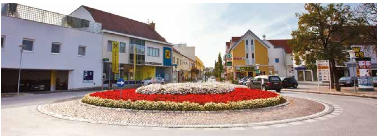
Leobersdorf's streets flourish in all colours.

Leobersdorf has committed to using entirely chemical-free, environmentally friendly weed-killing methods. A specially designed vehicle sprays weeds with 140°C steam. This process triggers a protein shock in the weeds that destroys the plant's cell walls. This toxin-free weed-control method is also safe for bees and other insects.