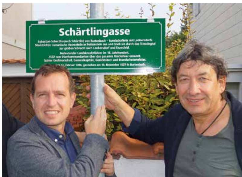
Simple street names turned into reminders of Leobersdorf's past.

Where did Schärtlinggasse or the Nowak-Mühle mill get their names from? Anyone who has ever wondered about these questions might find the answers on their next walk: the town has compiled the stories behind Leobersdorf's street names and buildings, recounting them on information plaques which have been installed on about 50 streets and 40 buildings. Their aim is to bring the stories about their namesakes to life.