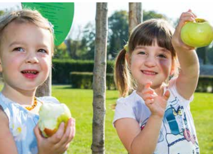
Eat Leobersdorf: Enjoy fresh fruits from public trees!

Having a quick snack is not only permitted, but explicitly encouraged thanks to the Essbares Leobersdorf ('Edible Leobersdorf') project. In public places such as parks and in planters, the town has planted fruit trees, berries and fruit bushes which residents can nibble from. In front of the town hall there are six 'herb barrels' – converted oak barrels, freshly planted with all kinds of kitchen and medicinal herbs. Whether it's oregano for your pizza or mint for your cocktail, you can pick all this and more anytime you like.