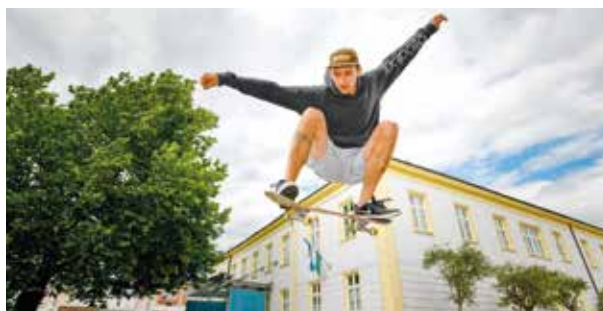
Supporting teens: the youth work TANDEM offers information and company when needed.

Since autumn 2018, there has been a new meeting place for young people in Leobersdorf: the covered pavilion behind the Security Centre was built by young people for young people. In addition to the youth centre on Alleegasse, the Tandem mobile youth work group is on the road all year round at many other locations in Leobersdorf. Young people aged 12 and over can contact the group about any issues they have.